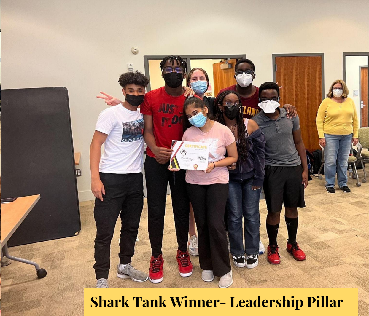
Shark Tank Winner- Leadership Pillar