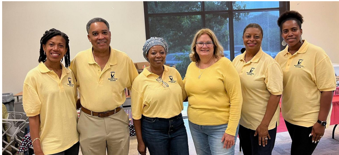
Summer Bridge Stress Buster 2022