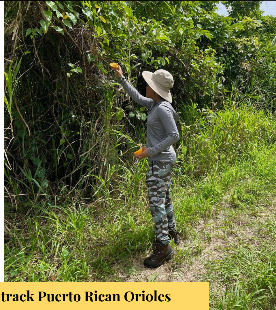
Omland Lab researchers track Puerto Rican Orioles