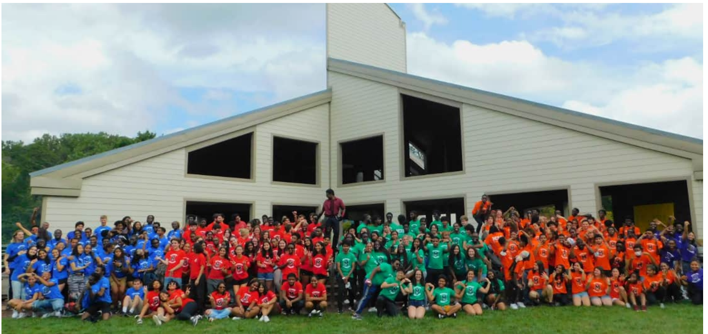
Meyerhoff Scholars at the 2022 Fall Retreat

Congratulations to the M34 Meyerhoff Scholars!