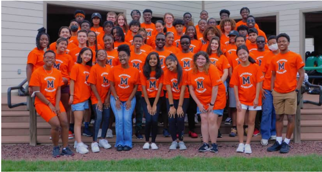
M34 Cohort at the 2022 Fall Retreat